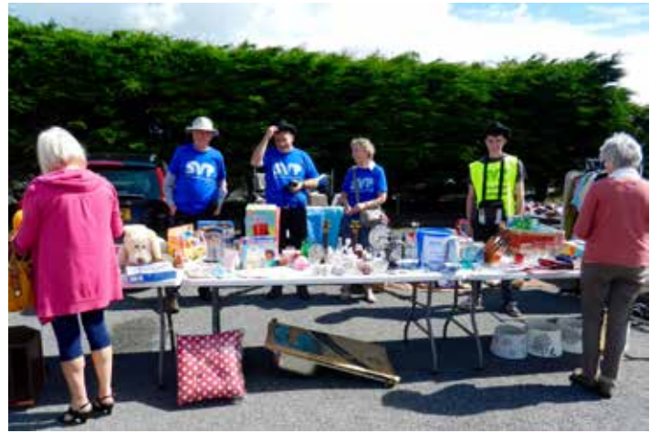
The Kingdom's car boot sale.