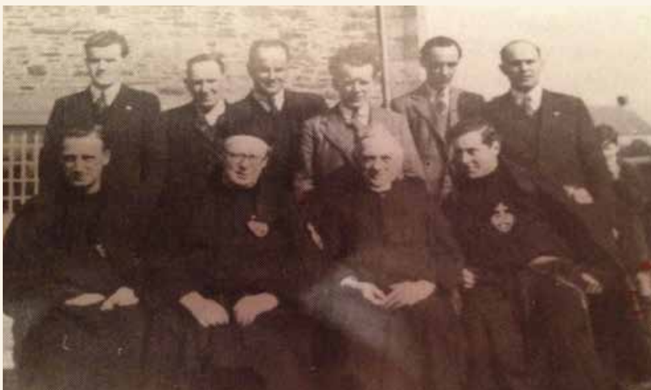
St. Vincent De Paul Society, April 1947