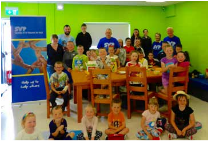
This year's summer scheme participants.