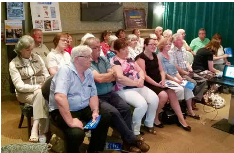
Team members from Vincent's in Enniskillen and Lisnaskea.

"The shops are very popular and we are also very grateful to and appreciative of all of our customers who donate and purchase items from Vincent's. All of